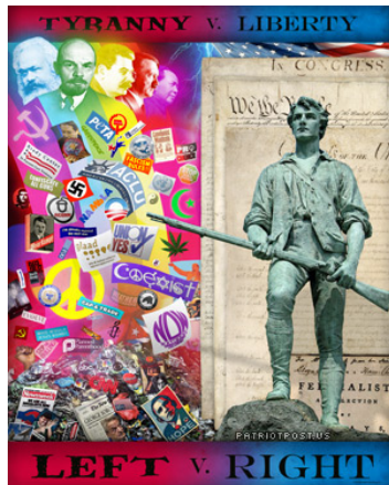
Left v Right

This iconic event, in protest of oppressive British taxation and tyrannical rule, became known as the Boston Tea Party.