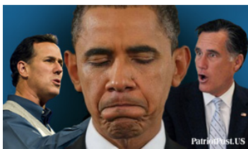
Focus on Obama

Thus, it is with regret that I conclude that if at least two of the three remaining candidates do not bow out by the end of April, we may well end with a chaotic and divisive brokered convention in Tampa -- and, consequently, the re-election of Obama. I believe Newt Gingrich should step out now -- for the greater good. Note that I deliver this analysis not to promote one candidate over another, but to advocate for the goal of defeating Barack Obama, strengthening our majority in the House and regaining a majority in the Senate. (Don't shoot the messenger!)