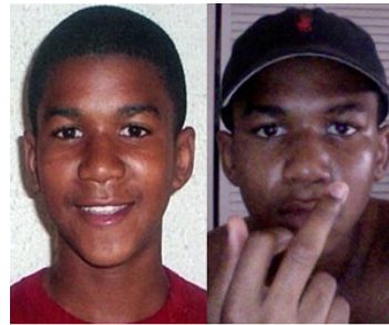
The real Trayvon Martin?

attack. How do we turn pain into power? How do we go from a moment to a movement that creates fundamental change? The blood of the innocent has power. Martyrs have power. [Martin] represents all of us. If it's a moment, we go home. If it's a movement, we go to war. There is power in the blood of the innocent."