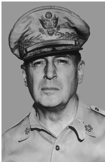
Gen. Douglas MacArthur

His name and fame are the birthright of every American citizen. In his youth and strength, his love and loyalty, he gave all that mortality can give. He needs no eulogy from me, or from any other man. He has written his own history and written it in red on his enemy's breast.