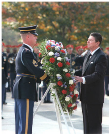
President Ronald Reagan

Our first obligation to them and ourselves is plain enough: The United States and the freedom for which it stands, the freedom for which they died, must endure and prosper. Their lives remind us that freedom is not bought cheaply. It has a cost; it imposes a burden. And just as they whom we commemorate were willing to sacrifice, so too must we -- in a less final, less heroic way -- be willing to give of ourselves.