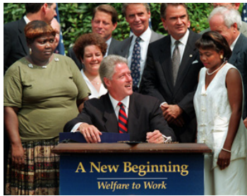
Bill Clinton signing welfare reform in 1996

"The imperial Presidency has overturned Congress and the law again. Not content to stop at rewriting immigration policy, education policy and energy policy, Thursday, President Obama's Department of Health and Human Services (HHS) released an official policy directive rewriting the welfare reform law of 1996. The new policy guts the federal work requirements that were the foundation of the Clinton-era reform. ... Welfare reform replaced the old Aid to Families with Dependent Children with a new program, Temporary Assistance for Needy Families (TANF). ... The whole point was that able-bodied adults should be required to work or prepare for work as a condition of receiving welfare aid. This reform was very successful . TANF became the only welfare program (out of more than 70) that promoted greater self-reliance. It moved 2.8 million families off the welfare rolls and into jobs so that they were providing for themselves. Child poverty fell, and single-parent employment rose. Recipients were required to perform at least 20-30 hours per week of work or job preparation activities in exchange for the cash benefit. Now, Obama's HHS is claiming that it can waive those work requirements that are at the heart of the law, and without Congress's consent. When it established TANF, Congress deliberately exempted or shielded nearly all of the TANF program from waiver authority. ... The TANF reform was one small step in the direction of reducing Americans' dependence on