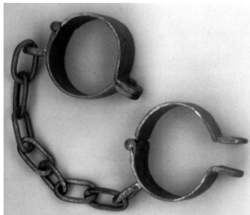
The price of forfeiting Liberty