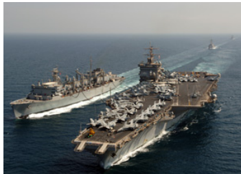
USS Enterprise with escorts and an auxiliary

"[Barack Obama is] certainly not a very good debater. He showed it again [last] Monday night. Obama lost. His tone was petty and small. ... That spirit led Obama into a major unforced error. When Romney made a perfectly