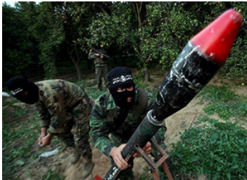
Jihadis with rockets

"Even with the fighting in Syria, the hottest crisis spot right now is obviously Gaza. In the last two weeks the number of rockets and mortars fired from Gaza into Israel grew into the hundreds, something no