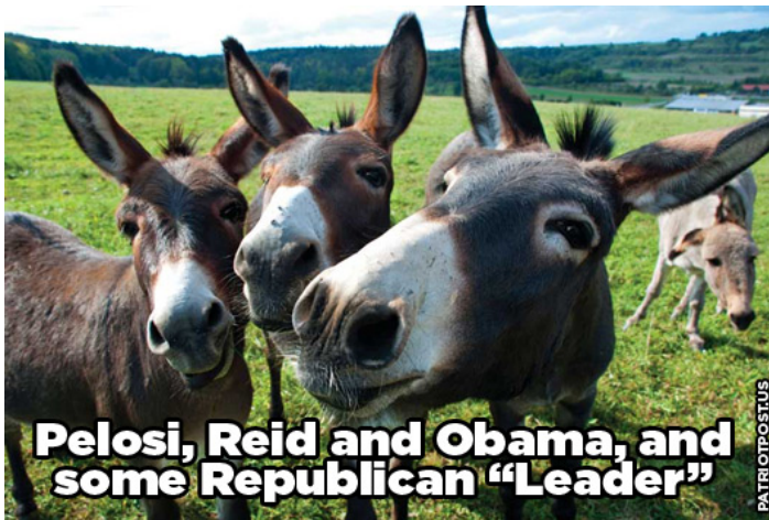
The Jackass Caucus

In the process he will continue to add debt to the current $16 trillion, and the couple trillion dollars in cuts to growth over 10 years, which is now on the table, isn't going to heal that fiscal hemorrhage.