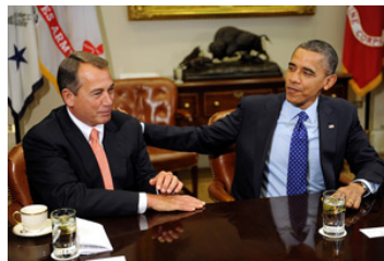
No 'grand bargain,' but a deal nonetheless

"The Senate-White House [fiscal cliff] compromise grudgingly passed by the House is a Beltway classic: The biggest tax increase in 20 years in return for spending increases , and all spun for political purposes as a 'tax cut for the middle class.' ... [T]he tax rate on capital gains will rise to 23.8% (including the 3.8% ObamaCare surtax), the highest rate since 1996, and at a time when business investment is mediocre. ... The estate tax deal is a reprieve only compared to the 45% that Mr. Obama wanted and the 55% that would have hit without a deal. Republicans still had to agree to a rate increase to 40% from 35%, and the $5 million exemption is a pittance for 50 years of work and thrift. ... As for small business, the overall tax increase this year is substantial. The new listed top rate of 39.6% doesn't include the phaseout of deductions that will take the actual rate to 41% or so for many taxpayers. Add the ObamaCare surtaxes on investment income (3.8%) and Medicare (0.9%), as well as the current Medicare tax of 1.45% (employee share), and the real top marginal tax rate on a dollar of