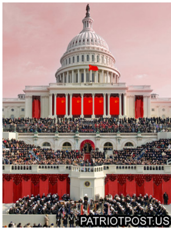
The Obama Inauguration

"Monday's inaugural address included a big dollop of 'give capitalism its due.' But it was just a spoonful of sugar to help Americans swallow their collectivist medicine. ... According to this president, 'being true to our founding documents ... does not mean we all define liberty in exactly the same way.' ... This is what we are to have in mind as we swallow the 'ask not what your country' line of Obama's address: 'preserving our individual freedoms ultimately requires collective action.' In other words, there is no real liberty without big government. ... Americans, Obama said, possess 'an endless capacity for risk' and 'we have never relinquished our skepticism of central authority, nor have we succumbed to the fiction that all society's ills can be cured through government alone. Our celebration of initiative and enterprise, our insistence on hard work and personal responsibility -- these are constants in our character.' It's all terrific lip service to the principles of economic freedom. But it was followed by the declaration that 'we reject the belief that America must choose between caring for the generation that built this country and investing in the generation that will build its future.' Translation: We can have our fiscal cake and eat it too. Forget