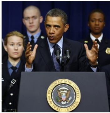
PhotoOp Prop Cops

Addressing the National Governors Association this week, Barack Hussein Obama proclaimed, "At some point, we've got to do some governing. And certainly, what we can't do is keep careening from manufactured crisis to manufactured crisis."