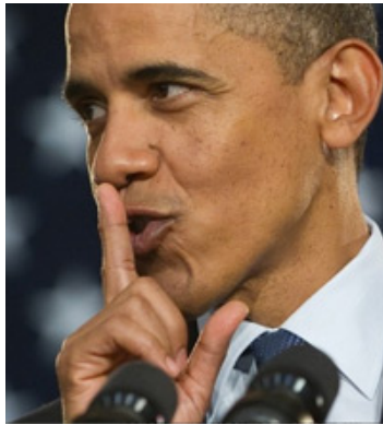
Shhhh! They are asleep!

Ahead of the implementation of sequestration on March 1st, I provided Beltway Republicans and pundits with a comprehensive analysis of Obama's sequestration strategy and objective under the title, " Obama's 'Republican Sequester' Setup ."