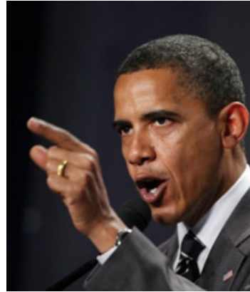
The Blame Shift Game

Thus, Obama's strategic objective is the evisceration of what's left of the Republican Party in order that his Socialist Democratic Party can control the Executive and Legislative branches, and most of the Judicial branch, effectively rendering the constitutional pretense of checks and balances null and void. That one-party control is a necessary component of his macro political strategy -- breaking the back of free enterprise under the weight of increased taxes, regulations and trillion-dollar annual deficits, and " fundamentally transforming the United States of America ."